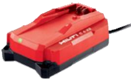
C 4-22 charger

Compact charger for light-duty applications where charging speed is not critical.