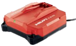
C 8-22 charger

Medium-speed charger for applications where charging speed is important but not critical.