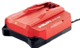
C 6-22 charger

Compact charger for light-duty applications where charging speed is not critical.